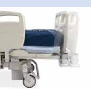
Built-in Bed Extender allows caregivers to easily add length to the bed.