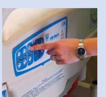
Point-of-Care<sup>®</sup> siderail controls are conveniently located in a central location, on both sides of the bed, where patient and caregiver interaction occurs.